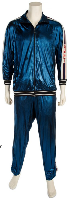
Elton John's tracksuit

Barbra Streisand's Caftan Worn in Meet the Fockers ; Billie Eilish's Signed Fender California Coast Ukulele; Bono's Handwritten and Signed Lyrics to "Love is Bigger than Anything in its Way"; Cher's Black and Silver Crystal and Stone Encrusted Jacket; Elton John's Gucci Metallic Blue Tracksuit, Nicole Kidman's Signed Prada Purse and More Offered