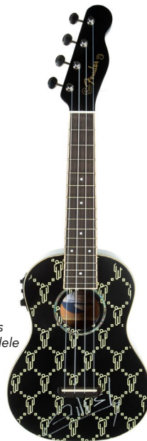
Billie Eilish's signed ukulele