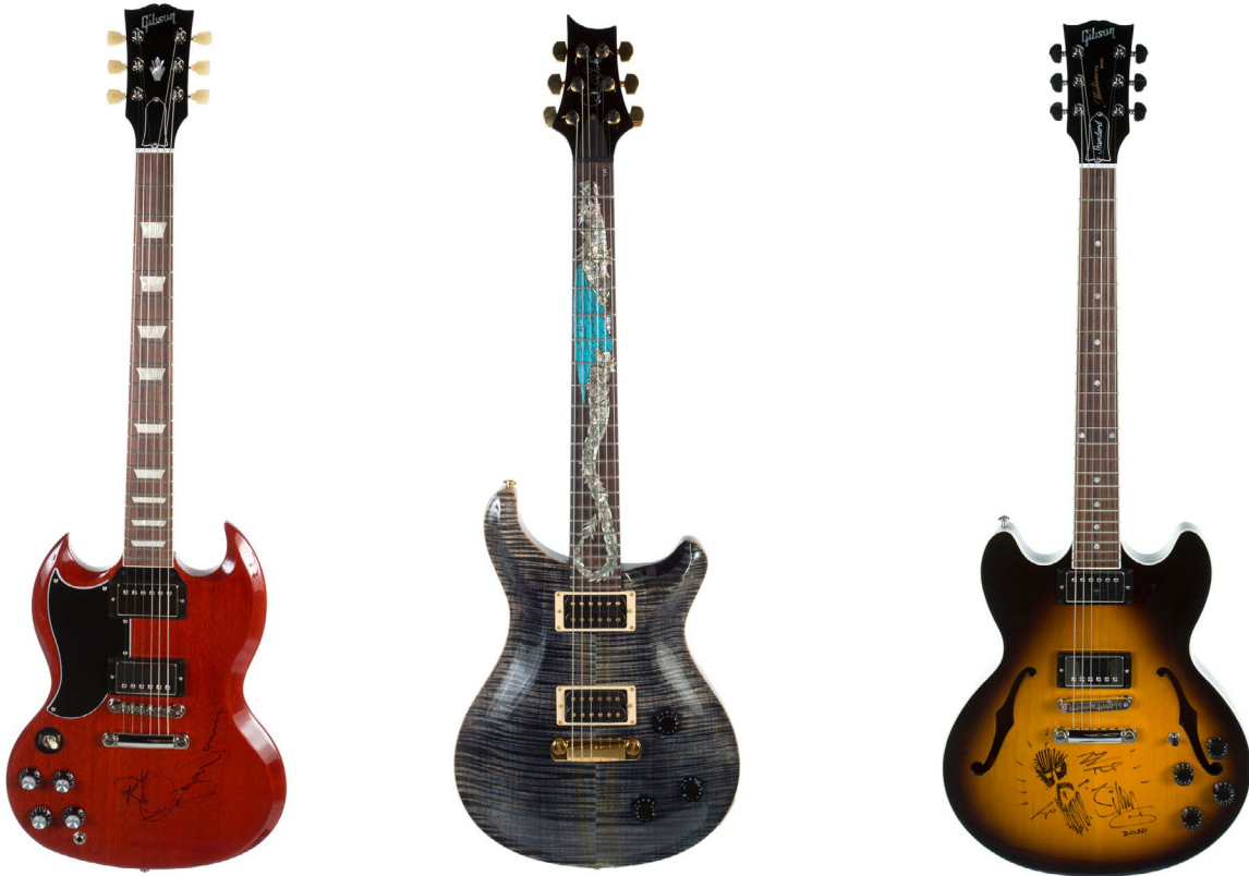
Above: Signed guitars from Robert Plant and Tony Iommi, Hans Zimmer and Billy Gibbons

The items offered by artists, athletes and entertainers includes Barbra Streisand, Bee Gees, Bill Wyman, Billie Eilish, Blake Shelton, Brandon Flowers (The Killers), Carlos Santana, Carole King, Cher, Chrissie Hynde, Coldplay, Darrell "Bubba" Wallace Jr., Depeche Mode, Elton John, Eric Clapton, Hans Zimmer, Joan Jett, John Stamos, Ozzy Osbourne, Patti Smith, Peyton Manning, Rhett Atkins, Rick Fox, Sir Tom Jones, Snoop Dogg, Thomas Rhett, Tom Petty, Tom Waits, Willie Nelson and more in a charity auction to benefit MusiCares, the charitable foundation which provides aid to artists and music community professionals in times of need.